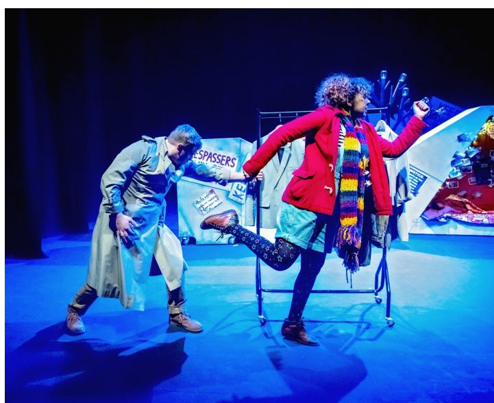
'The Selfish Giant' by Wrongsemble