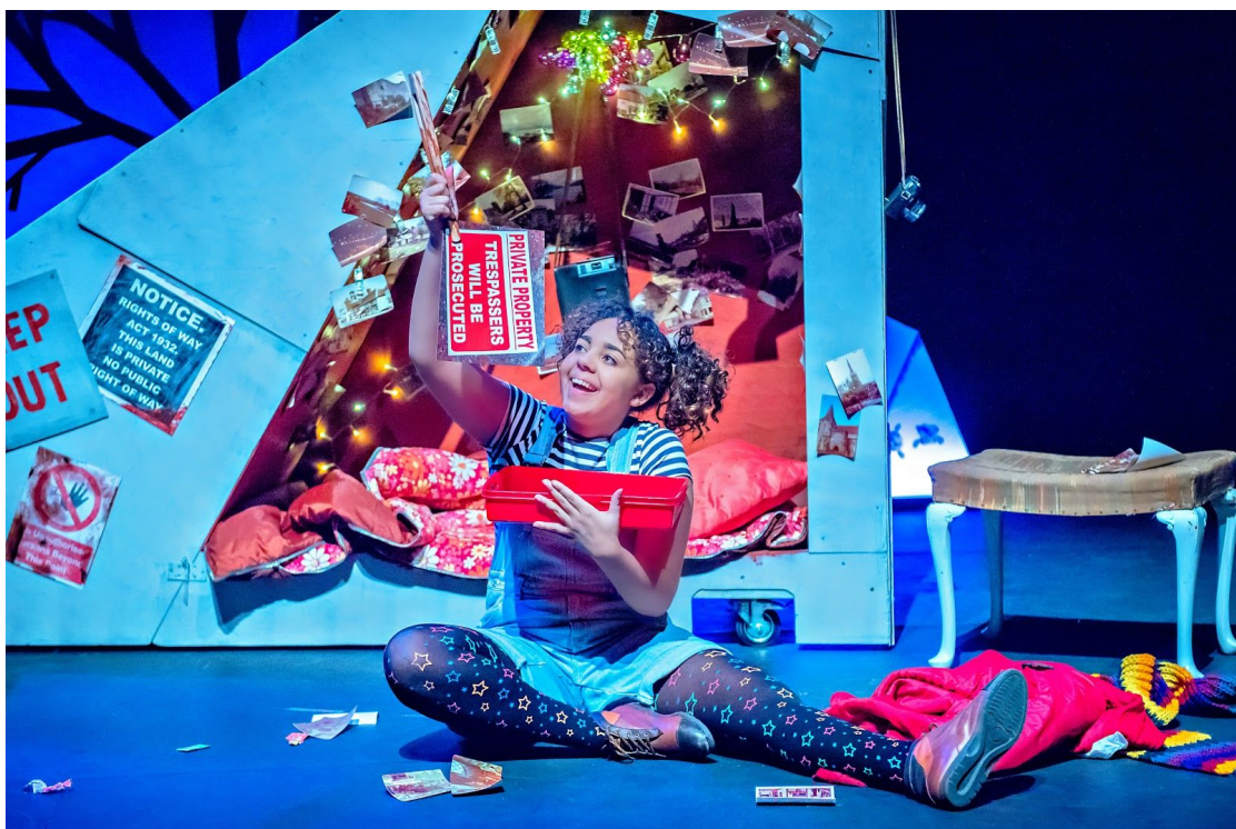
'The Selfish Giant' by Wrongsemble

Youtube Trailer: https://www.youtube.com/watch?v=_ShZjnaqaeU